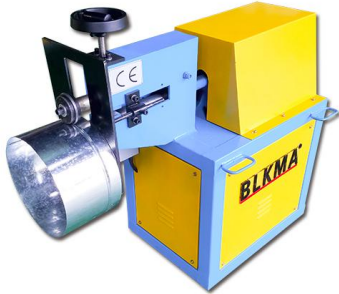
Round Duct Grooving Machine